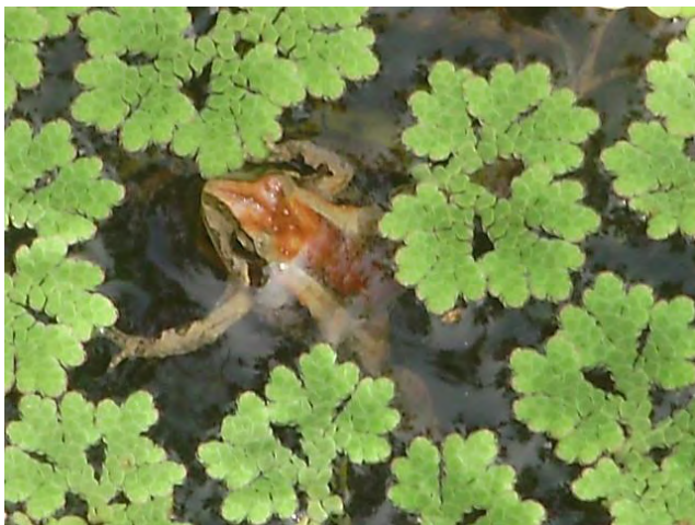
Eastern Common Froglet – Crinia signifera