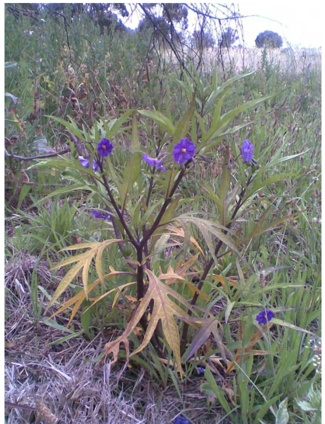
Kangaroo Apple (Solanum laciniatum) - Ryans Creek

We have also planted a number of Kangaroo Apples ( Solanum laciniatum ) this year. These have been planted on the banks of Ryans Creek. It is great to see them flowering so shortly after planting as they are also quick growing. They will provide food for birds and should self seed.