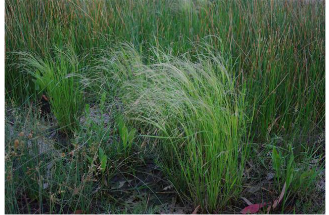
Swamp Wallaby Grass (Amphibromus neesii) in Ryans Creek

Some of the wetland grasses we planted in winter are now flowering at Ryans Creek in the Melton Botanic Garden – these hopefully will be self seeding 2010. These are plants purchased through the Melbourne Water and Vision for Werribee Plains Grants.