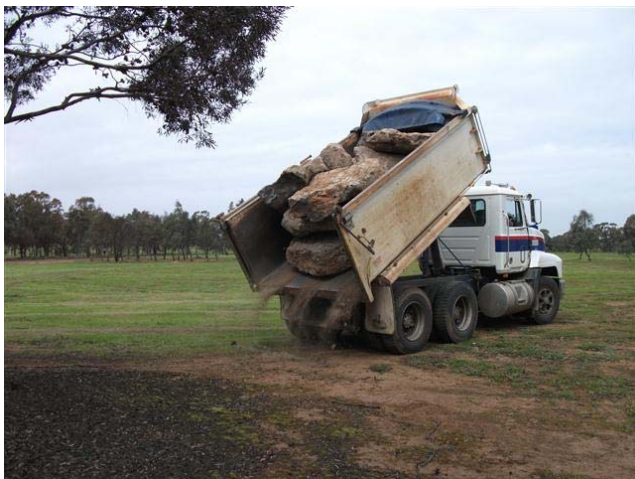
Ready, steady, go!