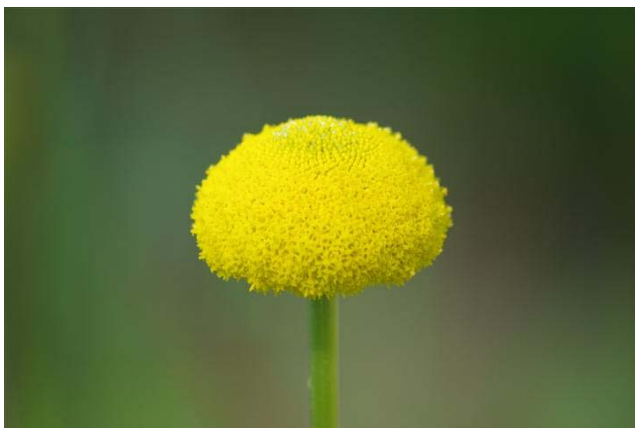
Pycnosorus globosus Drumsticks

The other indigenous yellow flowers that can be seen on Ryans Creek are Ranunculus lappaceus the Australian Buttercup.