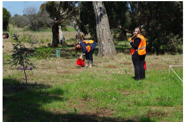
FMBG Volunteers watering the plantings

Next Grow the Garden Days are Thursday 14 th and Sunday 24 th October.