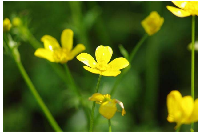
Ranunculus lappaceus the Australian Buttercup

The other indigenous yellow flowers that can be seen on Ryans Creek are Ranunculus lappaceus the Australian Buttercup.