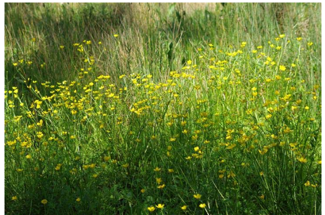
Large planting of Ranunculus lappaceus - Australian Buttercup