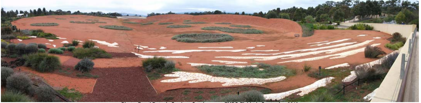
Photo: Royal Botanic Gardens Cranbourne – FMBG Field trip September 2010