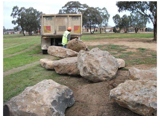
That's the lot