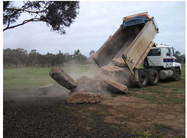
Here they come