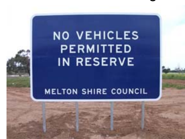
The rather large sign that suddenly appeared

Visitors to the Melton Botanic Garden may see this newly erected sign. It does mean you are not allowed to drive your vehicle into the Melton Botanic Garden unless you are on an authorised activity such as Grow the Days, Clean up days etc. The sign is little over powering and MSC are going to relocate it near the Industrial Estate cut-through and replace this sign with smaller no unauthorised vehicles allowed sign.