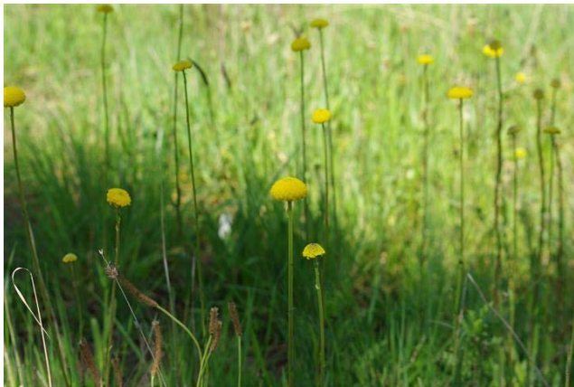
Pycnosorus globosus Drumsticks at Ryans Creek

Pycnosorus globosus common name Drumsticks is flowering with large bright yellow flowers high and flower heads about 3cm in diameter. As you can see in the photographs they have large yellow, ball-shaped flowerheads on erect stems up to 50cm in height, we have one which is on a one metre stem in the middle of the creek. According to one source they flower from November to February, ours have started in September. These are well worth a look before they finish flowering. Hopefully these will start to self seed.