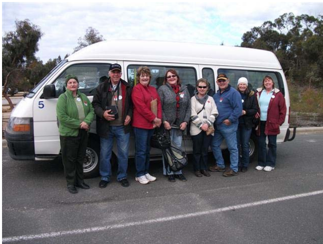
Friends in bloom