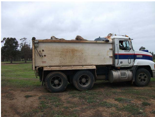
Truck arriving with rocks

David and Bard Pye are germinating the seeds over the next few weeks. Volunteers will be called to help pot these up in November and next year. We will also need to move them to Melton next March as it warmer than Bullengarook – would anyone be prepared to care for some of these 1,000 trees in forestry tubes next March?