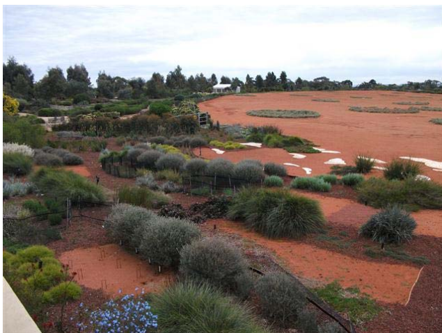
The red centre?