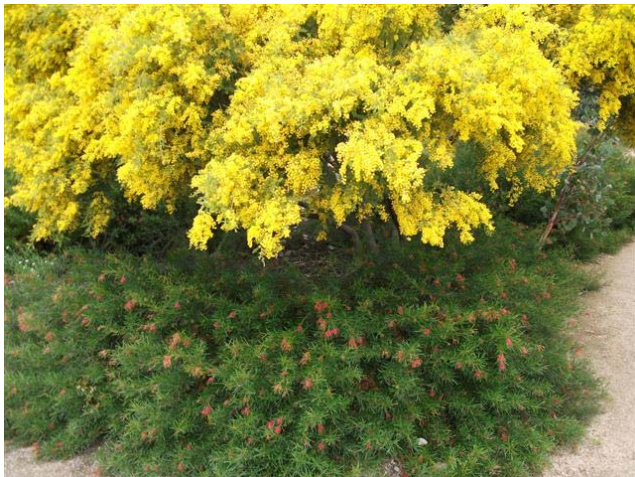
Acacias and Grevilleas in bloom

Many plants were just coming into flower but it was a stunning show. John spent much of the time photographing the various types of paths as we have to build some in the Eucalyptus Arboretum in coming months.