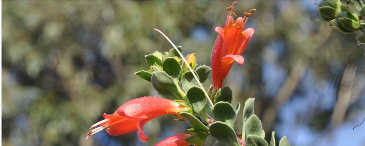
Eremophila MBG - June 2013