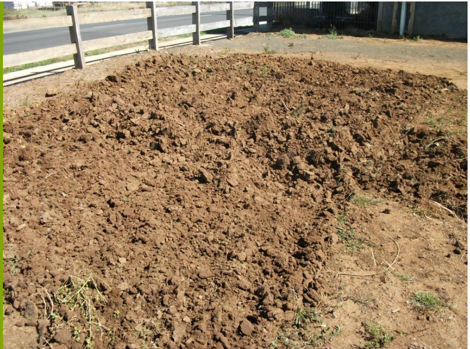
PAG Disability Garden beginning to be dug over as part of the site preparation