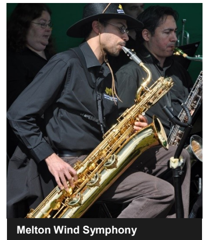
Melton Wind Symphony