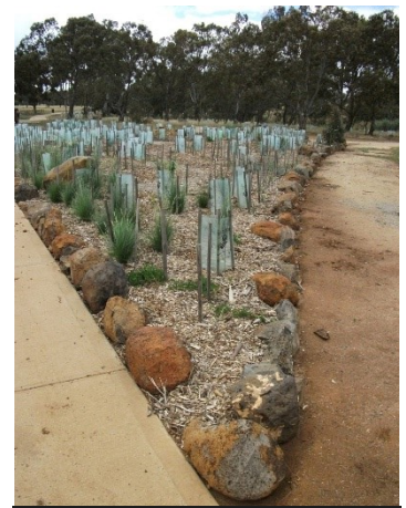
Looking from the west