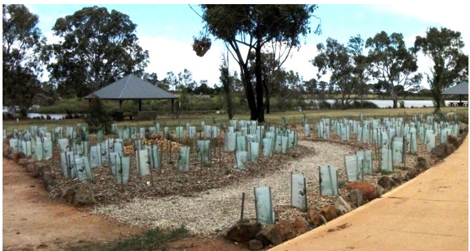
Koori Student Garden from Fluker Post MBG3