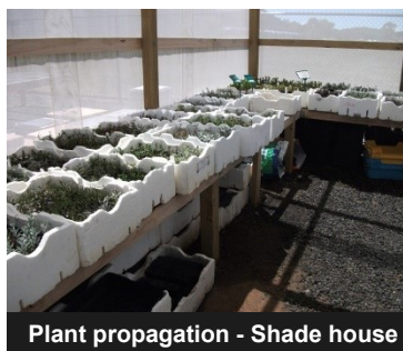
Plant propagation - Shade house