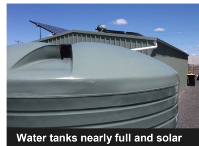
Water tanks nearly full and solar