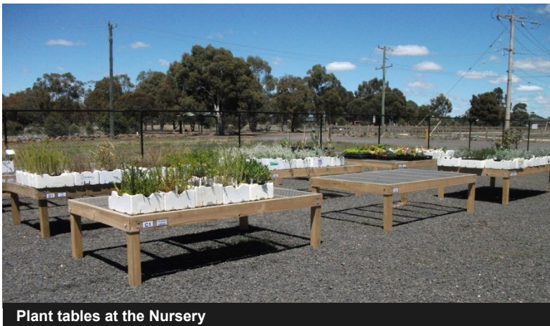
Plant tables at the Nursery

We look forward to having a plant sales area in 2014 if we are successful in our application to the City of Melton for a permit to operate the sales area at the depot.