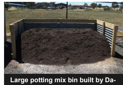
Large potting mix bin built by Da-