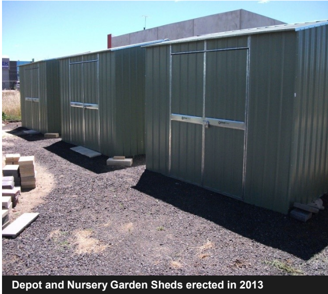
Depot and Nursery Garden Sheds erected in 2013