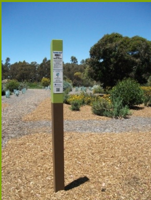
Fluker Post MBG1