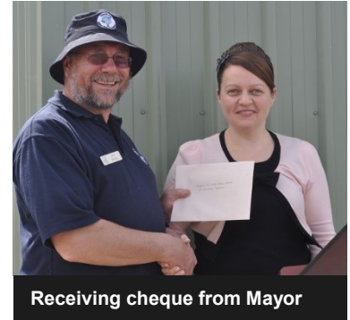
Receiving cheque from Mayor