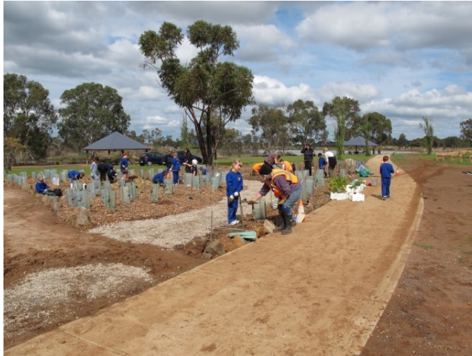
Planting with Koori students