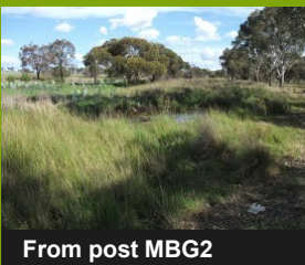
From post MBG2

You can see the Fluker Posts and where yours and others photos will be posted at: www.flukerpost.com