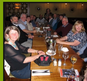
One of the tables at the dinner

It was great to celebrate, catch-up and reflect on 10 years of FMBG.