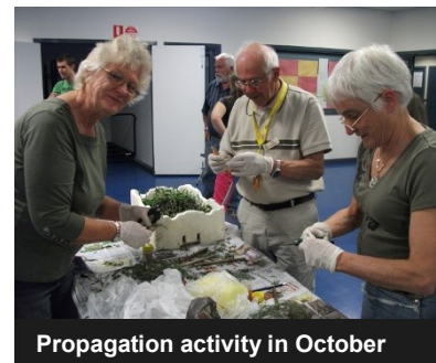
Propagation activity in October