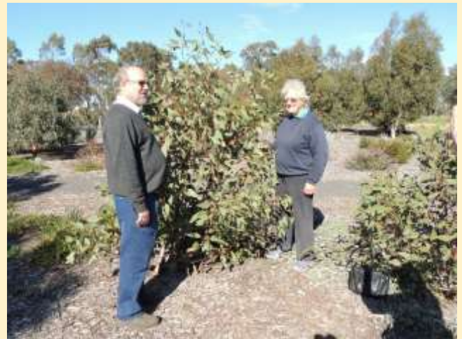
The Pyes bedside Eucalypts youngiana