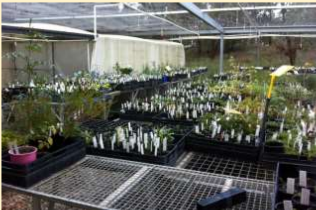
Cranbourne Friends Nursery