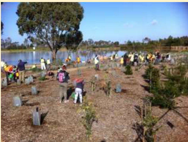
Lots of planting activity