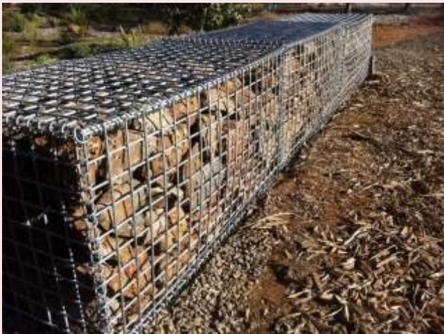
The Bushfoods Garden project is being done by our Matchworks Work Experience Activity Team