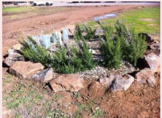
Mediterranean garden bed near the Depot

There is a small Mediterranean garden bed with rock edging and planted with Rosemary thanks to our work experience activity team.