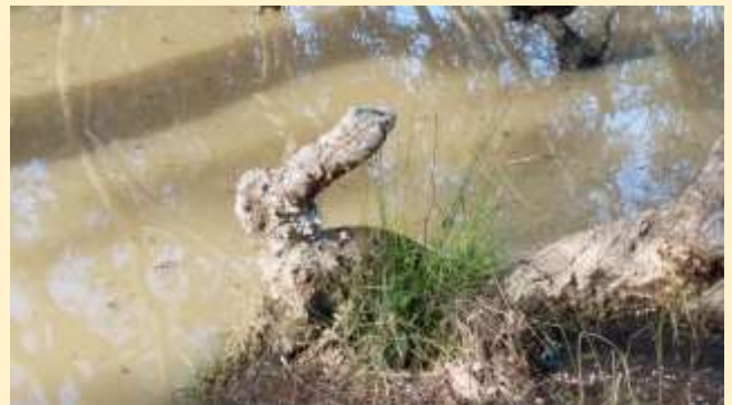
Is this a hare frozen in time?