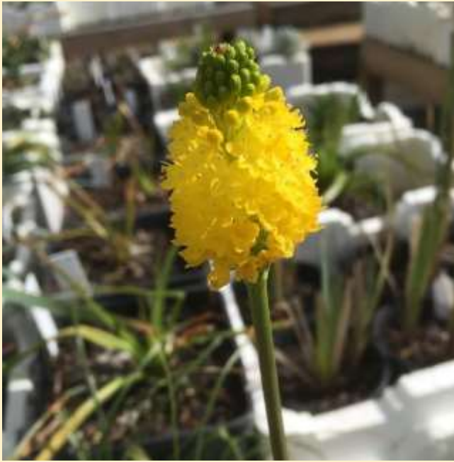
Bulbine Lily in Botanic Garden