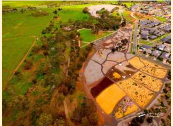
Drone Photo Sunday 18 September 2016

Brad from Above & Beyond Photography has been taking overhead videos and photos of the Melton Botanic Garden with his drone.