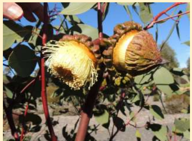
Eucalypts youngiana (yellow form)