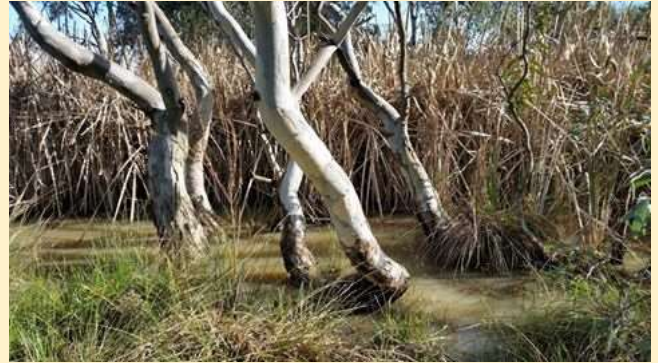
River Red Gums in the Main Lake